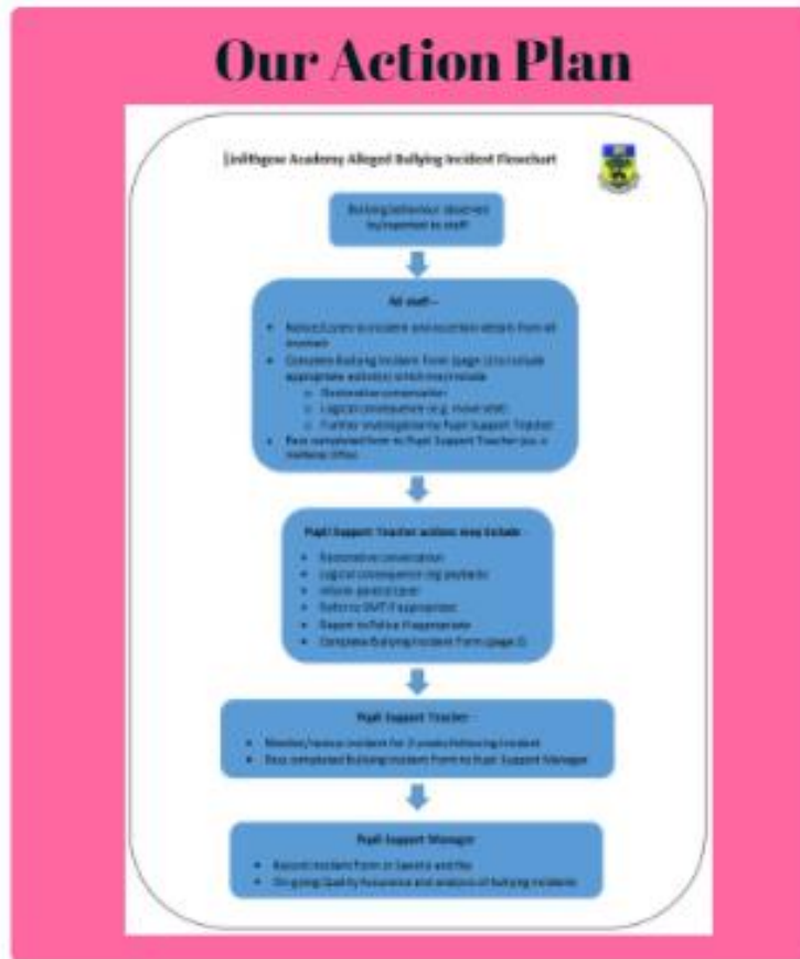
Linlithgow Academy Alleged Bullying Incident Flowchart